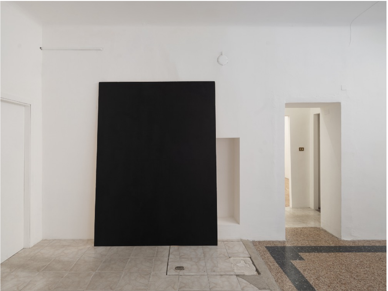
Emilio Prini Senza titolo , 1996 Paint on wood 252 x 185 cm

le vite Via Pietro Crespi 9 IT-20127, Milano MI mail@levite.it