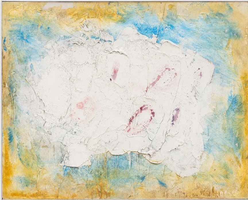
Henrik Olesen Hey Plasticity, 2021 Oil and acrylic on paper, mounted on masonite, painting butter, tape, aluminium 40.5 x 50.5 cm

le vite Via Pietro Crespi 9 IT-20127, Milano MI mail@levite.it