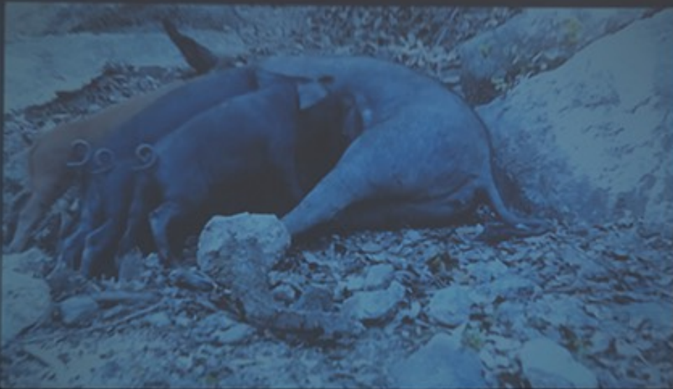
Marie Angeletti Wild Pigs , 2020 1 channel video projection (color, sound) 3:08 min

le vite Via Pietro Crespi 9 IT-20127, Milano MI mail@levite.it