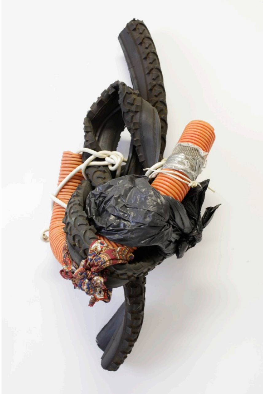
Franco Bellucci Senza titolo , 2014 Various materials 55 x 27 x 20 cm

le vite Via Pietro Crespi 9 IT-20127, Milano MI mail@levite.it