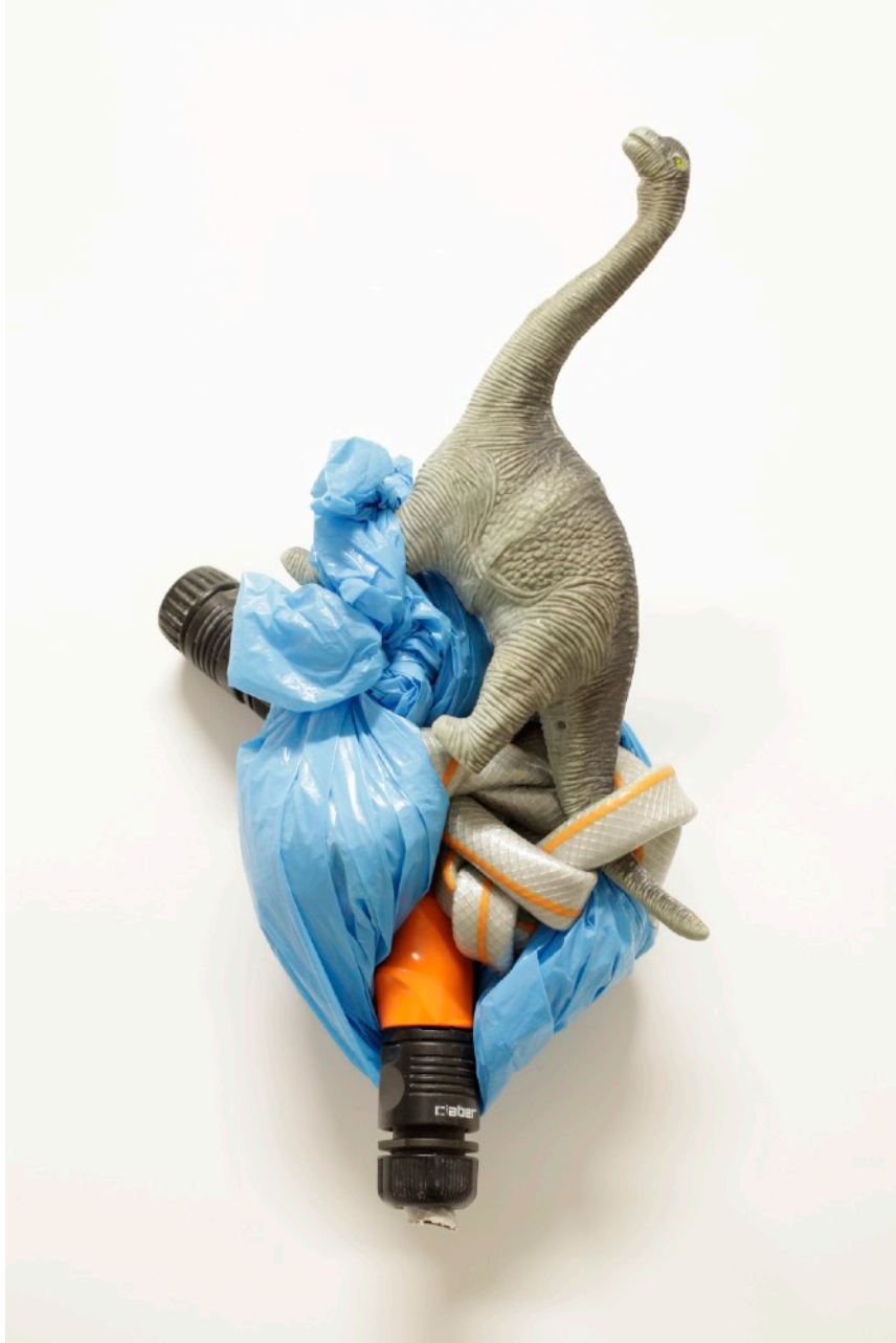
Franco Bellucci Senza titolo , 2013 Various materials 39 x 21 x 13 cm

le vite Via Pietro Crespi 9 IT-20127, Milano MI mail@levite.it