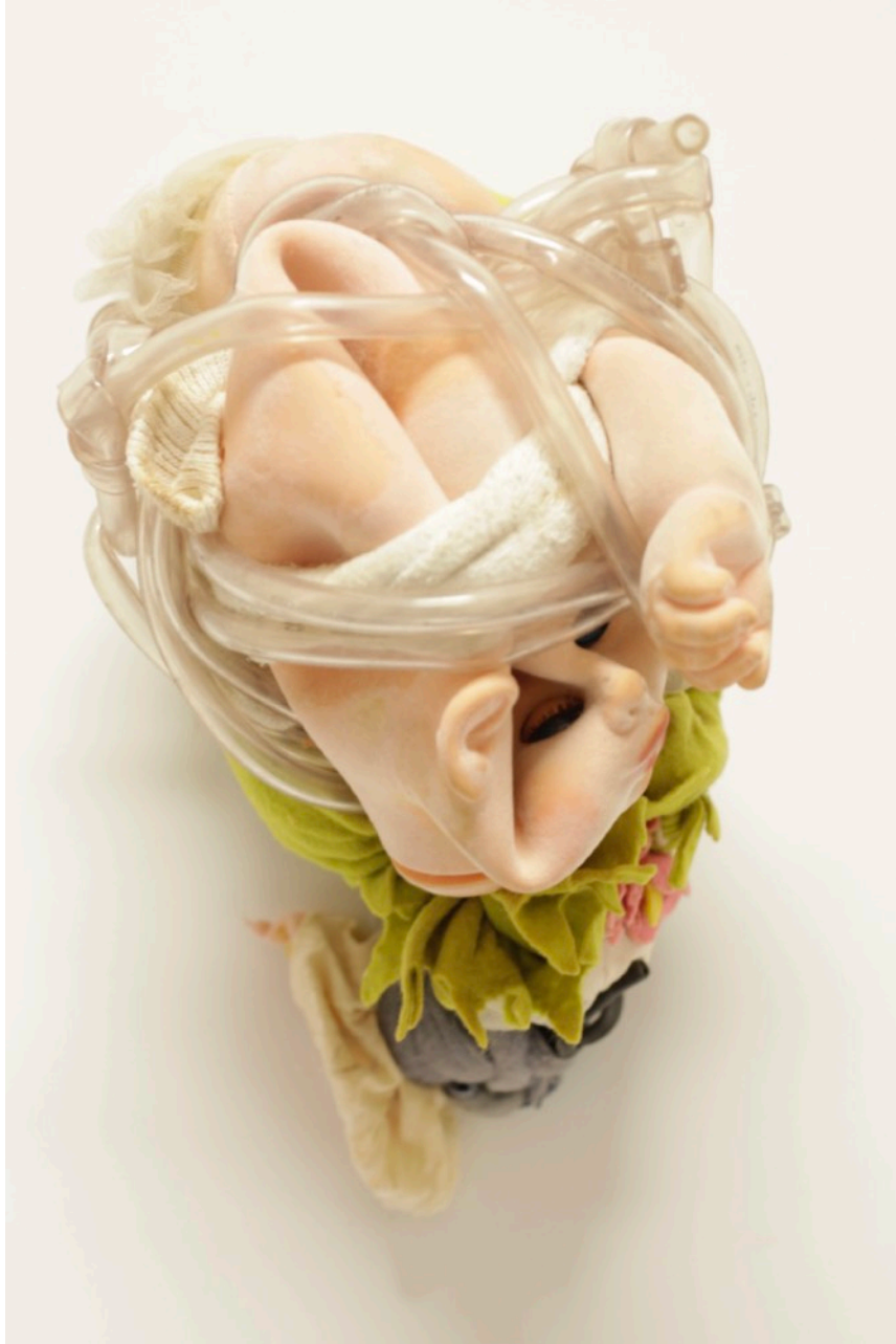
Franco Bellucci Senza titolo , senza data Various materials 29 x 20 x 17 cm

le vite Via Pietro Crespi 9 IT-20127, Milano MI mail@levite.it