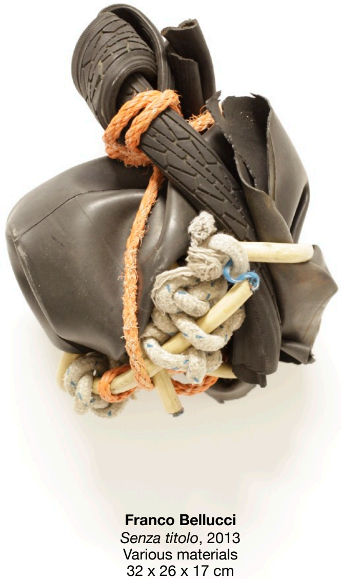
Franco Bellucci Senza titolo , 2013 Various materials 32 x 26 x 17 cm

le vite Via Pietro Crespi 9 IT-20127, Milano MI mail@levite.it