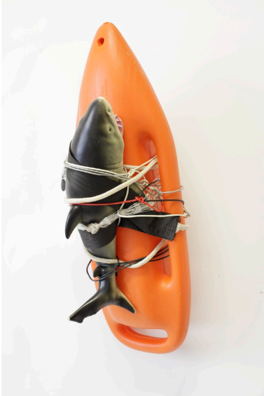
Franco Bellucci Senza titolo , 2015 Various materials 65 x 25 x 26 cm

le vite Via Pietro Crespi 9 IT-20127, Milano MI mail@levite.it