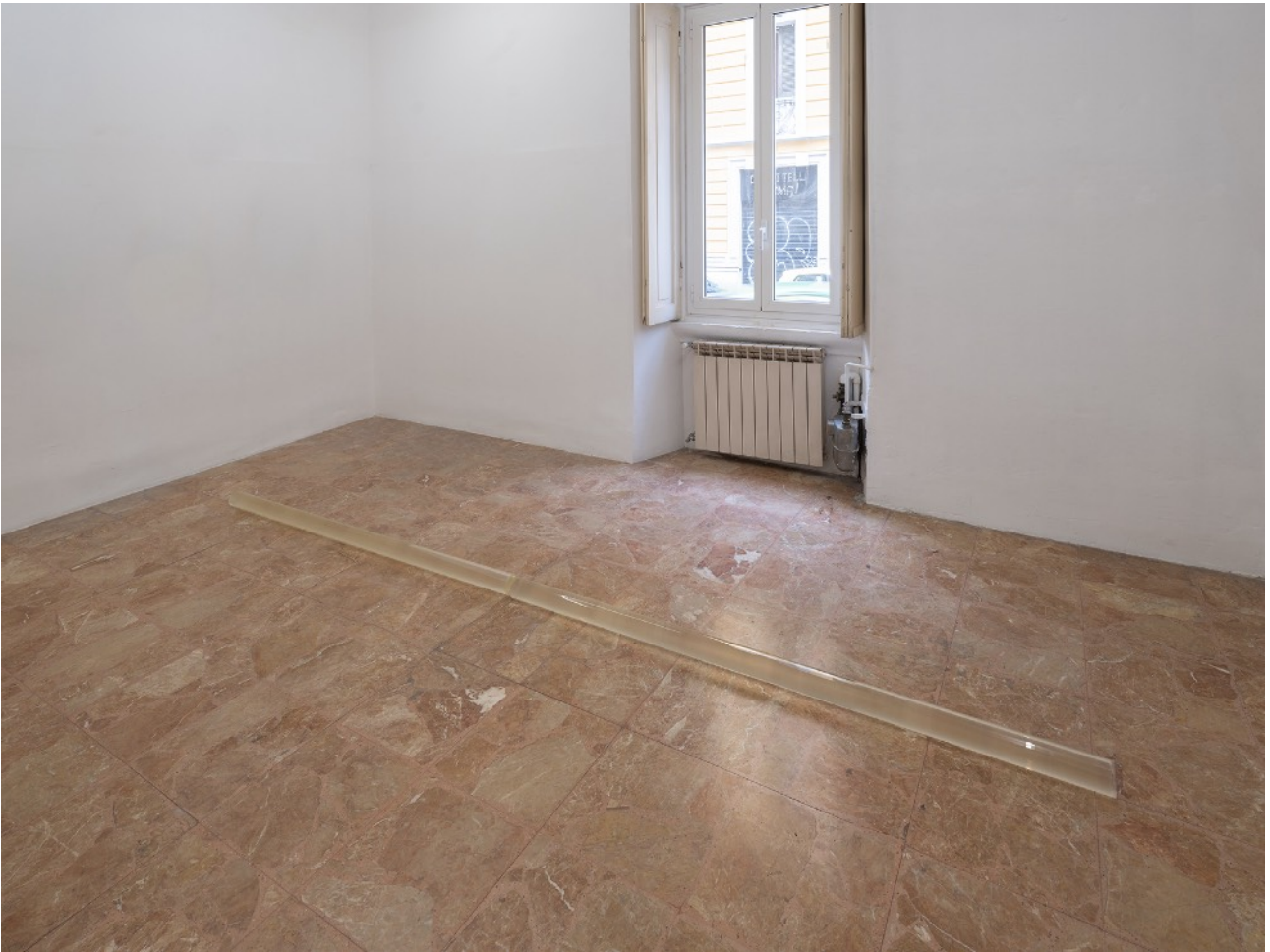
Gianna Surangkanajai Untitled, 2023 (2 out of 6) Glue in acrylic glass 8 × 200 × 8 cm

le vite Via Pietro Crespi 9 IT-20127, Milano MI mail@levite.it