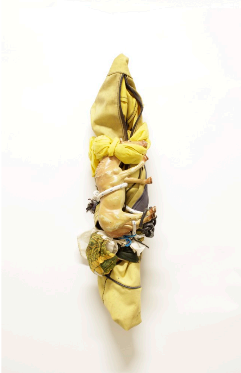
Franco Bellucci Senza titolo , 2018 Various materials 60 x 20 x 13 cm

le vite Via Pietro Crespi 9 IT-20127, Milano MI mail@levite.it