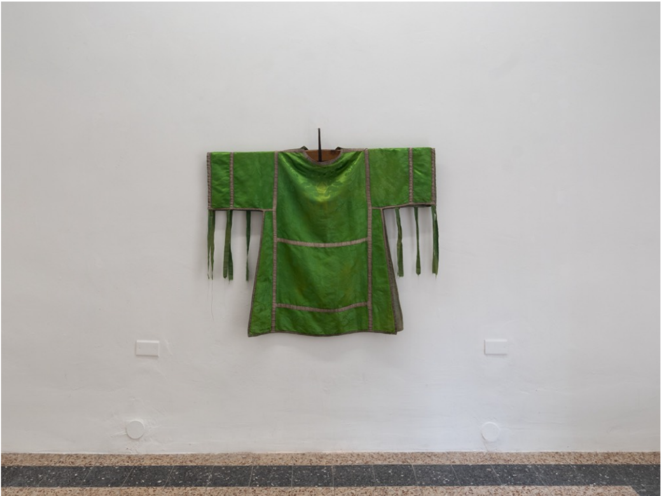
Attributed to Gianluca Belloni Dalmatic 110 x 120 cm

le vite Via Pietro Crespi 9 IT-20127, Milano MI mail@levite.it